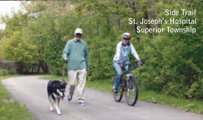
Side Trail St. Joseph's Hospital Superior Township