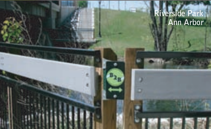
Riverside Park Ann Arbor