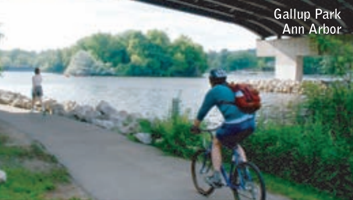
Gallup Park Ann Arbor