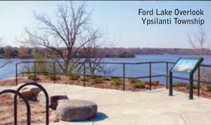
Ford Lake Overlook Ypsilanti Township