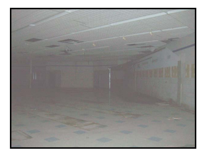
PHOTOGRAPH NO. 17: SUBJECT PROPERTY FORMER RITE-AID – 2564 PACKARD STREET