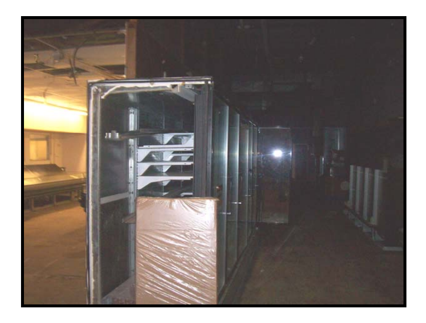
PHOTOGRAPH NO. 19: FORMER KROGER'S FORMER SHIPPING AND RECEIVING AREA