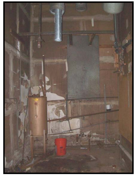
PHOTOGRAPH NO. 15: PARCEL G1 – FORMER DRY CLEANERS ABANDONED DRY CLEANING EQUIPMENT