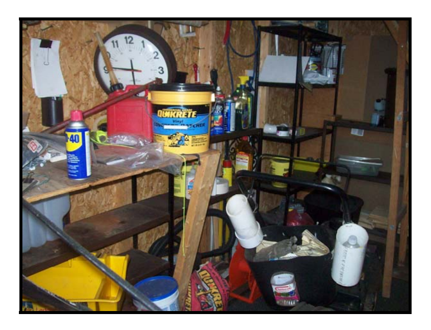
PHOTOGRAPH NO. 25: MAINTENANCE SHED INTERIOIR