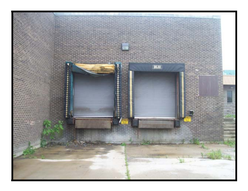
PHOTOGRAPH NO. 21: SUBJECT PROPERTY LOADING DOCK AREA