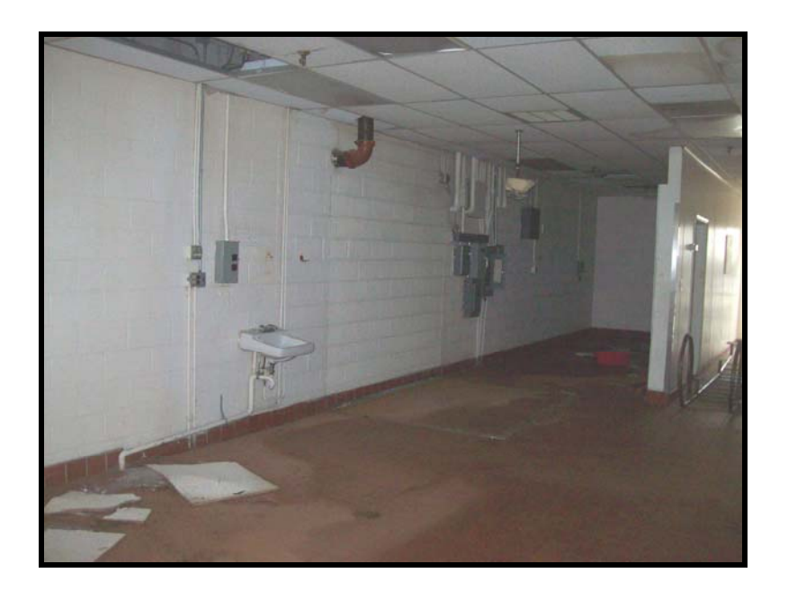
PHOTOGRAPH NO. SUBJECT PROPERTY FORMER ANTHONY'S PIZZA – 2520 PACKARD STREET