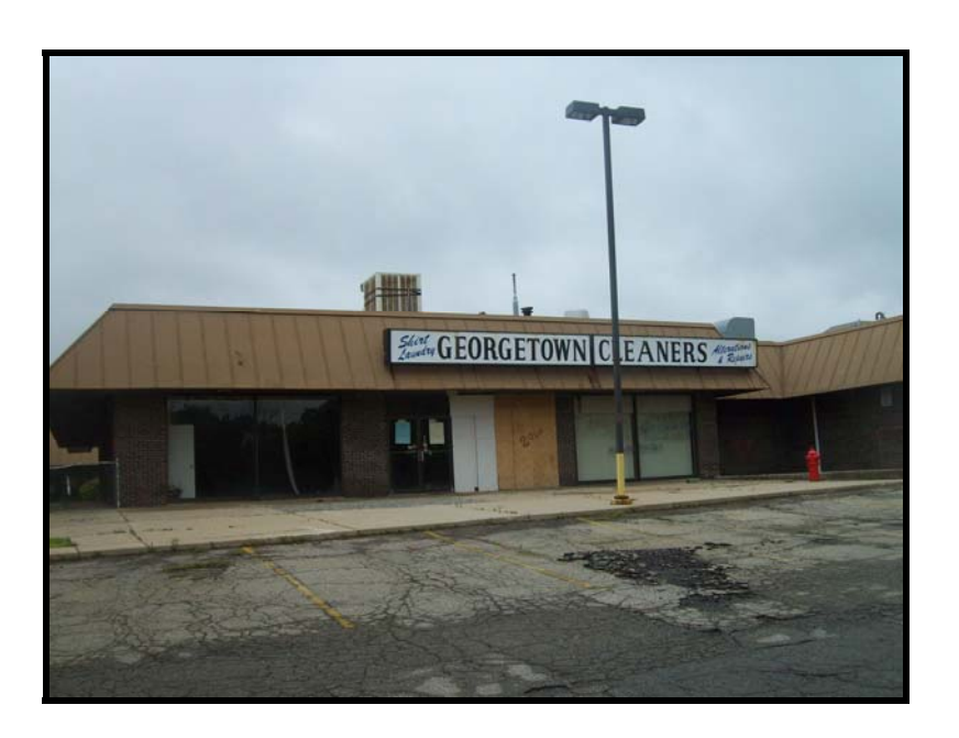
PHOTOGRAPH NO. 11: SUBJECT PROPERTY FORMER GEORGETOWN CLEANERS – 2554 PACKARD STREET