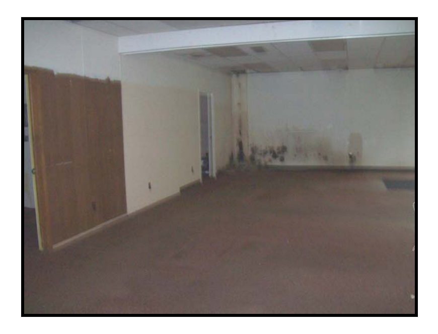
PHOTOGRAPH NO. 7: SUBJECT PROPERTY FORMER STUDIO 13 SALON AND SPA – 5216 PACKARD STREET (NOTE MOLD ON BACK WALL)