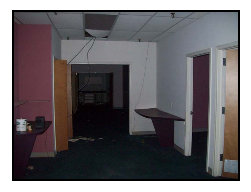
PHOTOGRAPH NO. 3: SUBJECT PROPERTY – FORMER OFFICE BUILDING TYPICAL OFFICE AREA