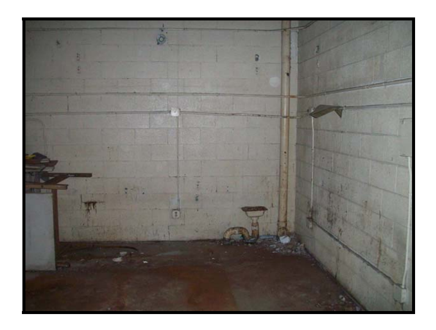
PHOTOGRAPH NO. 13: FORMER DRY CLEANERS LOCATION OF FORMER DRY CLEANING MACHINE